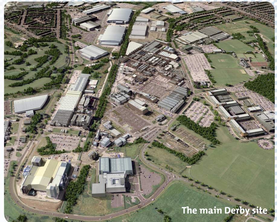
The main Derby site